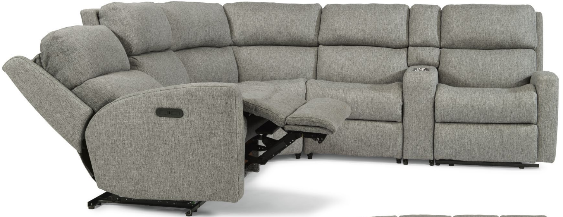
2900 Power Reclining Sectional with Power Headrests [shown with LAF Power Recliner with Power Headrest, Armless Power Recliner with Power Headrest, Full Wedge, Armless Chair, Straight Console, RAF Power Recliner with Power Headrest]

Only available in South Haven fabrics Styles also available without power or power headrests