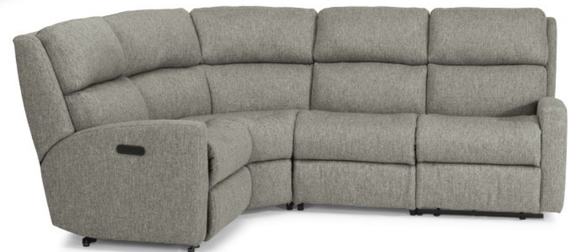
2900 Power Reclining Sectional with Power Headrests [shown with LAF Power Recliner with Power Headrest, Full Wedge, Armless Chair, RAF Power Recliner with Power Headrest]

© Flexsteel Industries, Inc. 4/16 • Rev. 10/16